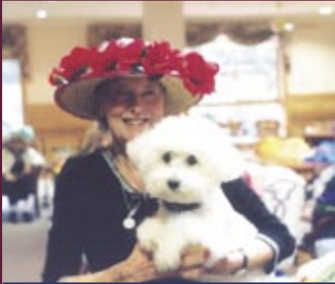
Chomley House Exclusive Aged Care Facility