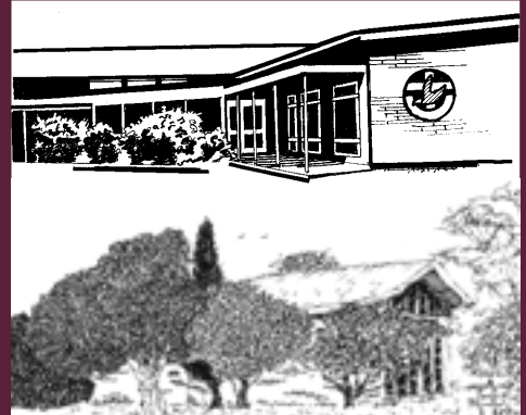
Blackburn North & Nunawading Uniting Church