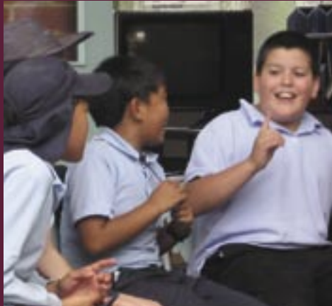
St Michael's Parish School